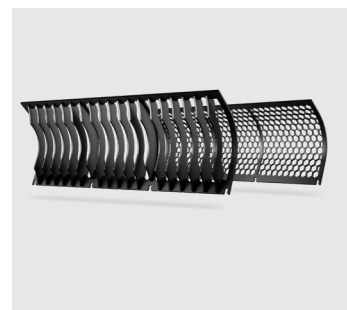
Screen Basket System

The contents, technical data and illustrations are non-binding and may be changed by the manufacturer without prior notice. In accordance with the protection notice ISO 16016.