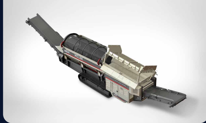
▲ HEAVY DUTY DRUM

The M518R delivers powerful screening in a compact, user-friendly design—perfect for compost, biomass, topsoil, and municipal waste. With a 180-degree radial fines conveyor and quick setup features, it offers maximum productivity with minimal hassle on any job site.