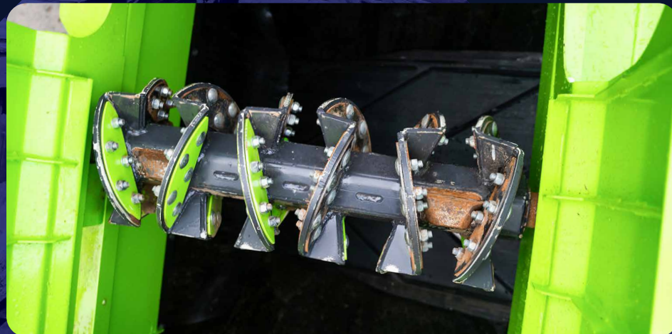
◀ MV224 HIGH ENERGY MIXING CHAMBER