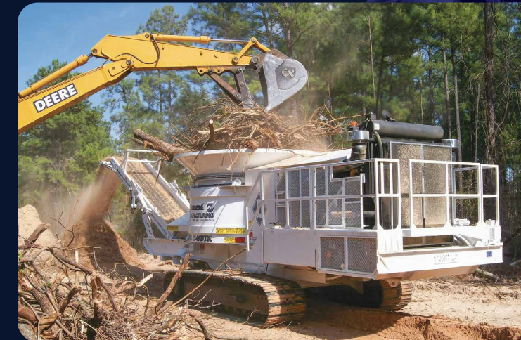
▼ GRINDER DZT 1248