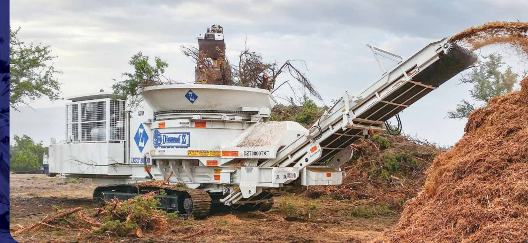
▲ GRINDER DZT 8000