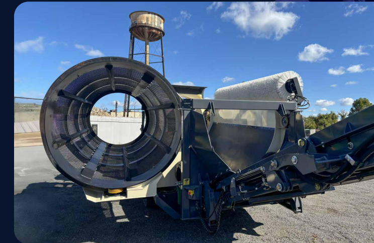
▲ EASILY REMOVABLE WITH FOLD-OUT SIDE