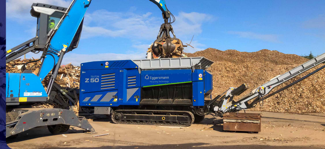
▲ SHREDDER Z 50