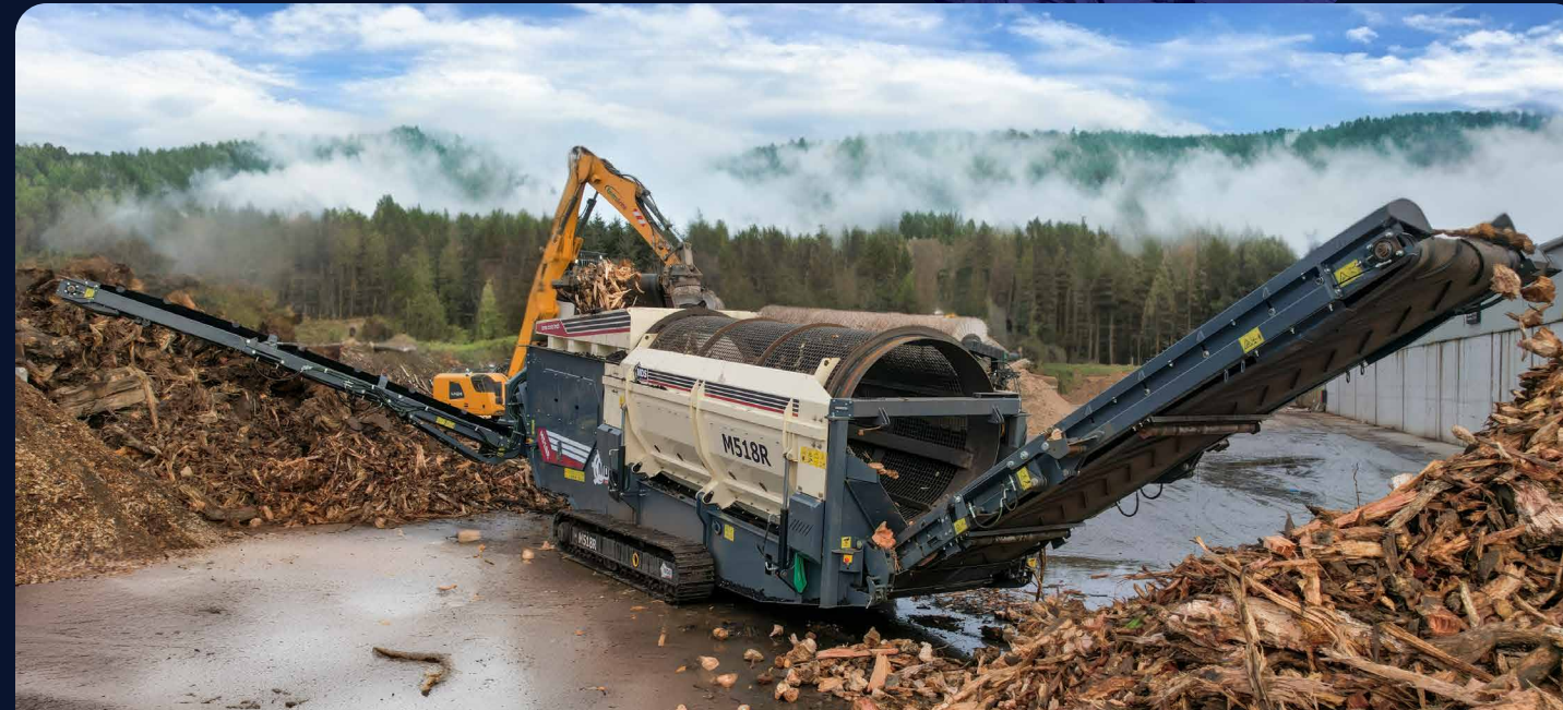
▼ TROMMEL M518R