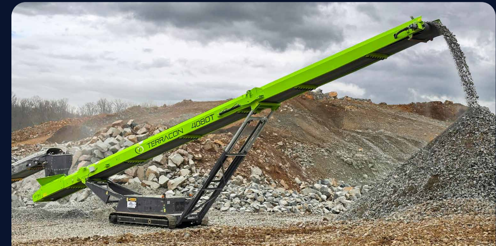
CONVEYOR 4080T ▶