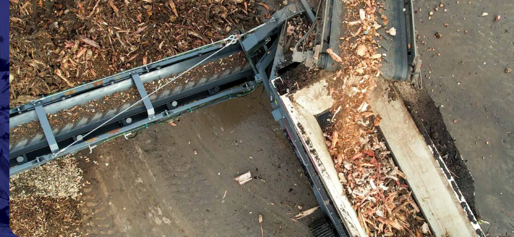
▲ 180° SWIVEL RADIAL FINES CONVEYOR