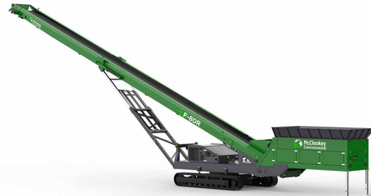
◀ RADIAL FEEDER STACKER EF-80R