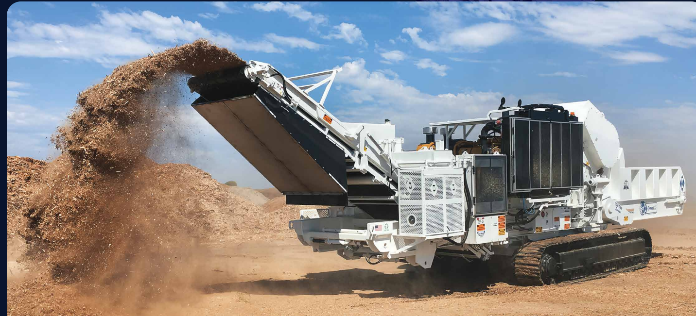
▼ GRINDER DZH 6000

From tub to horizontal grinders, Diamond Z delivers maximum efficiency and productivity. Trusted in recycling, forestry, and biomass energy, their machines keep operations running strong.