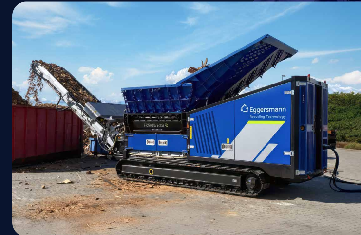
▼ SHREDDER F 38