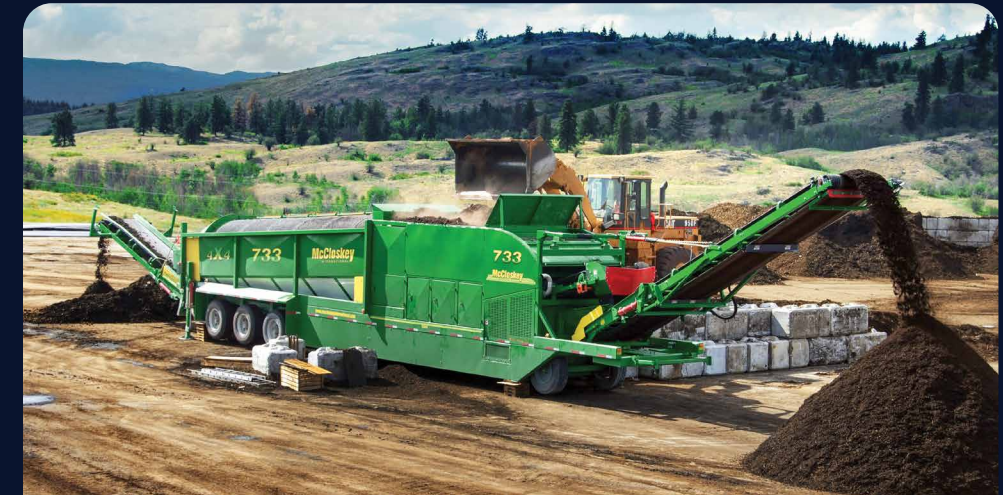
TROMMEL 733 ▶