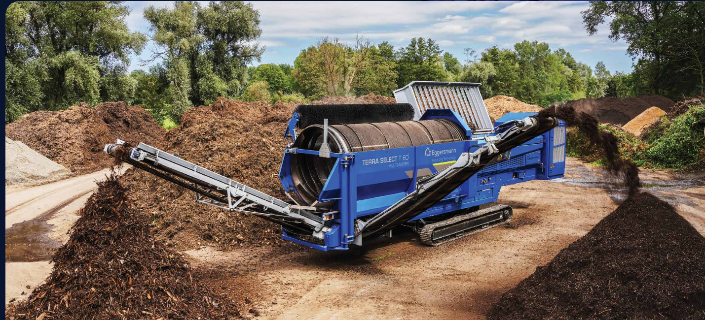
▼ TROMMEL T 60

Backed by decades of expertise, Eggersmann delivers eco-friendly solutions that meet the evolving demands of sustainable waste management, making them a trusted partner for industries across North America.