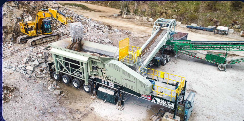
◀ JAW 3062J-W, CONVEYOR 6042M