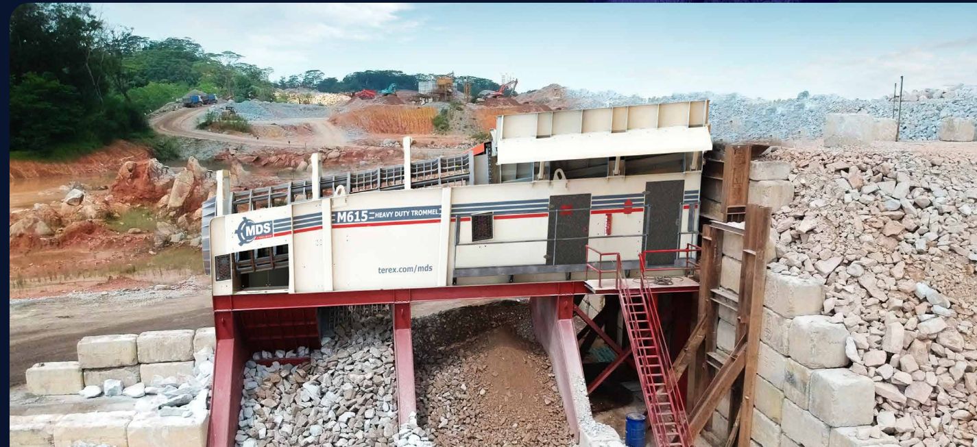
▼ TROMMEL M615