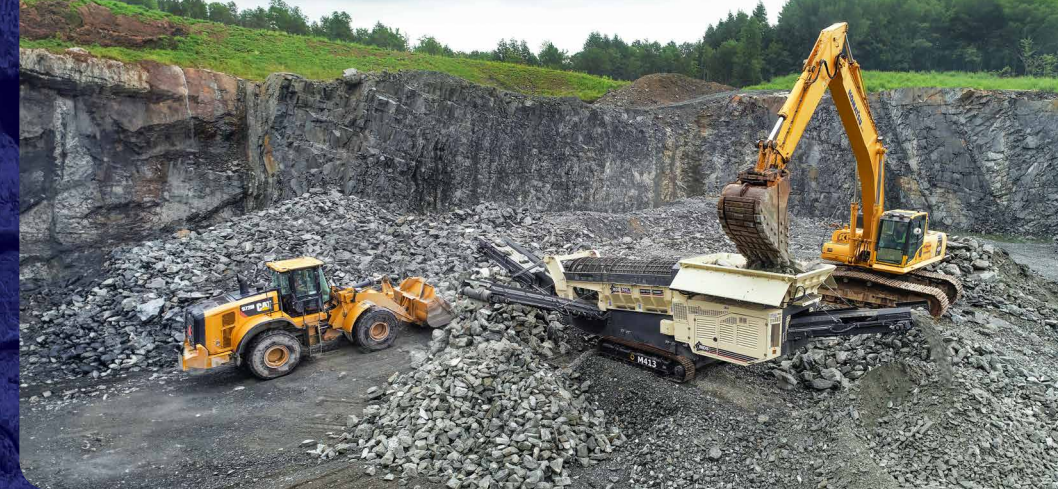
▶ TROMMEL M413

With high throughput and efficiency at its core, MDS delivers tailored solutions for industries like mining, construction, and recycling. When the job demands the best, MDS International rises to the challenge.