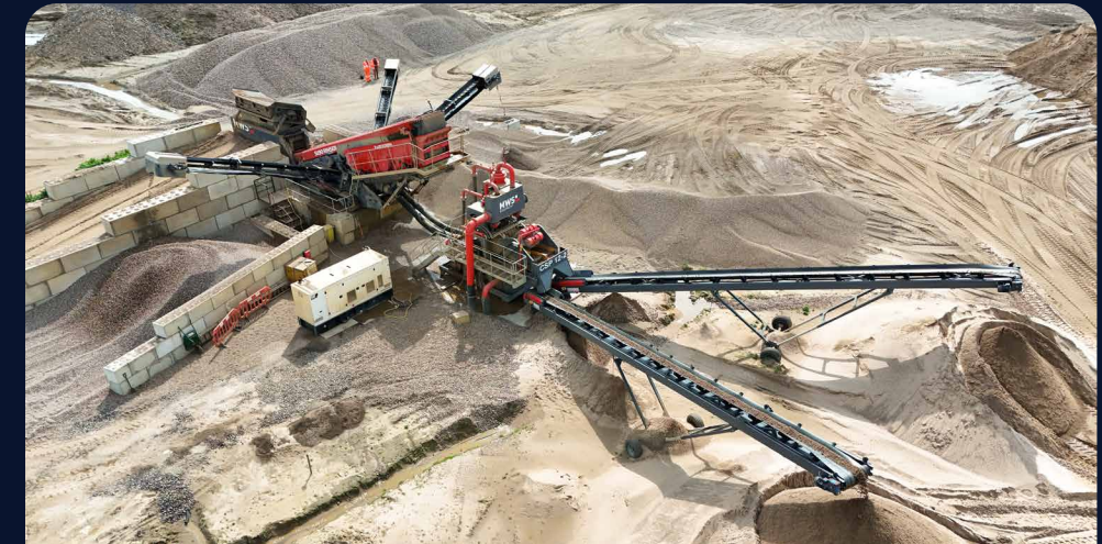
COMPACT SAND PLANT 12-2 ▶