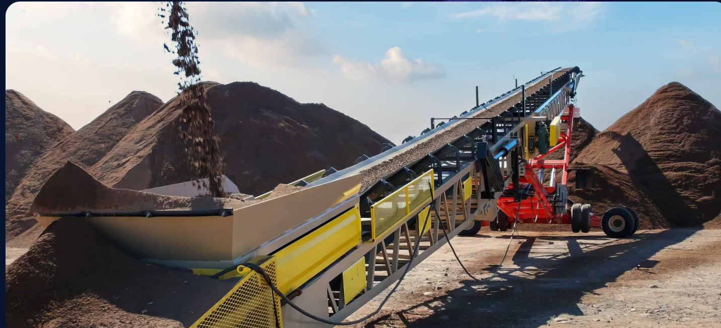
▼ RADIAL STACKER